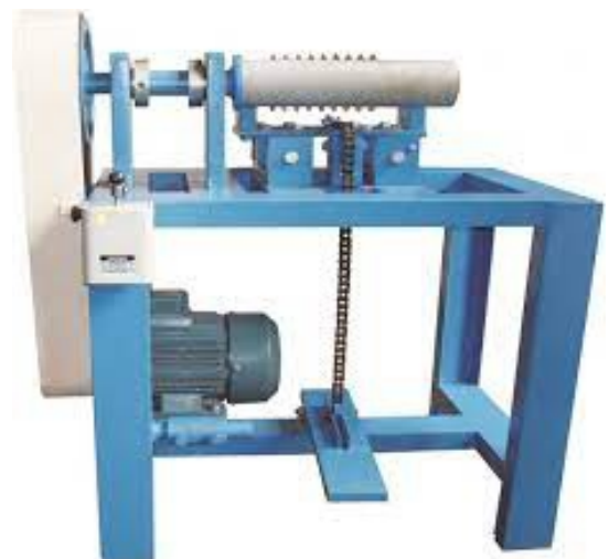
CORE CUTTING MACHINE